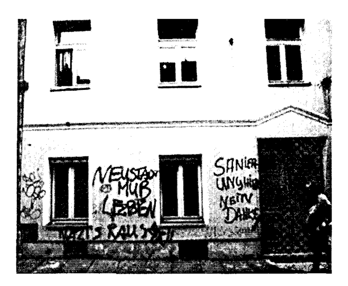
Fig. 6. Graffiti on renovated facade, Dresden Neustadt.

city. The current situation in Dresden illustrates that urban places are not frozen in time, and that there is a mutually interactive relationship between the social and spatial environments of urban places. At the moment the spatial Dresden is a fragmented collage of various urban "typologies," reflecting not only historical transitions of social structures, but a range of social environments residing in Dresden at this particular point in time. Those with the power are making important decisions regarding which images will dominate. This images will also influence the various identities of individuals with their city.