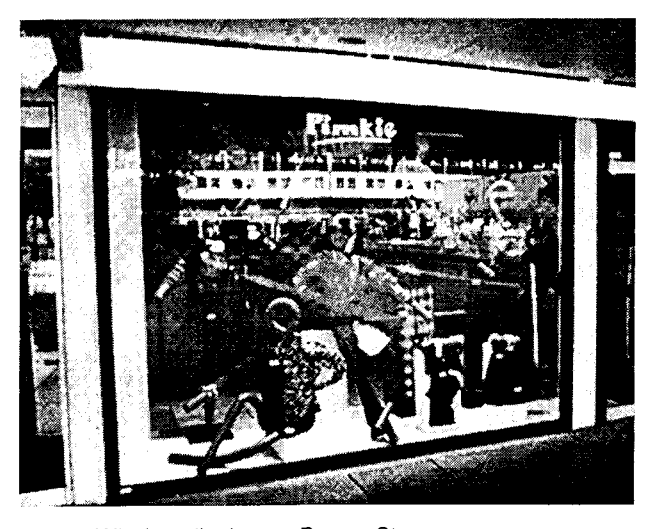
Fig. 3. Window display on Prager Strasse.

buildings in brown. The amount of brown is roughly equal to the amount of white. Another more accessible public forum for the presentation of construction proposals and documentation of the process are the local newspapers. Almost daily appears an article about a new building project.