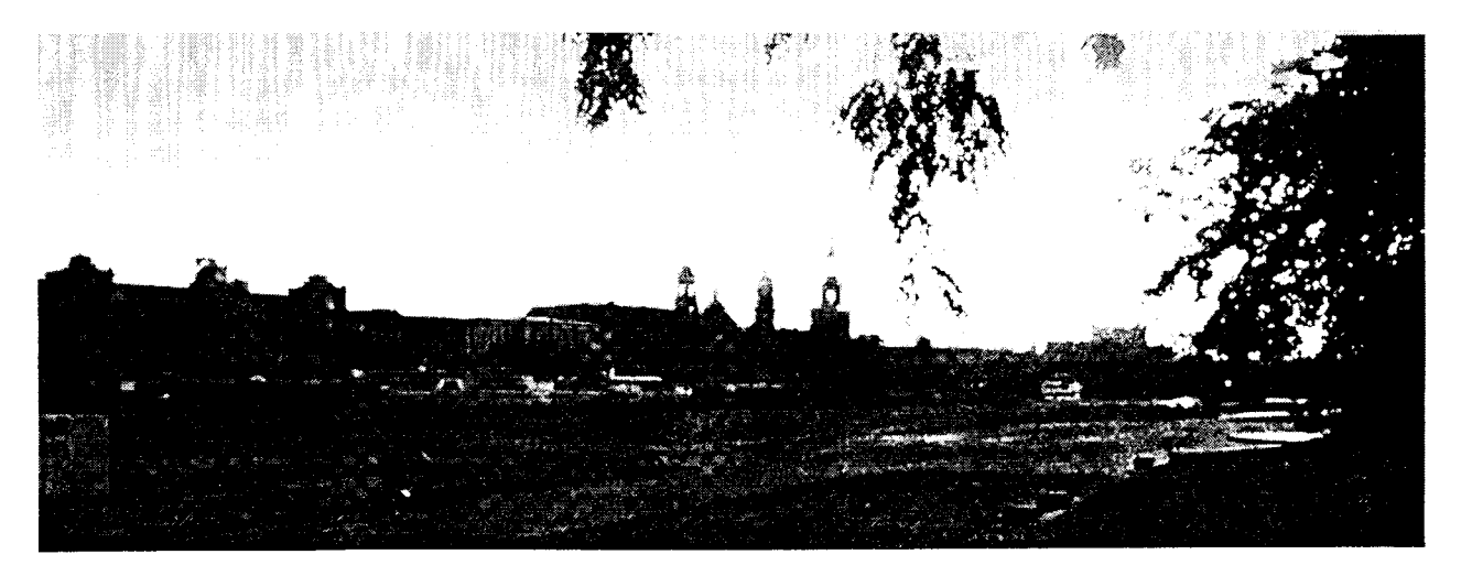
Fig. 2. Same view of Dresden skyline in 1996, without the Frauenkirche.