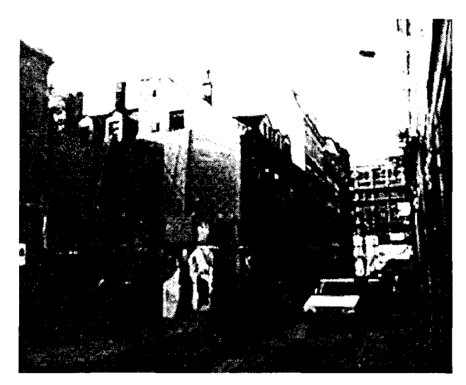
Fig. 5. Dresden Neustadt.

Historically, the Bunten Republik Neustadt is passed. Its imprint on the social and spatial realms of the district remain, coexisting with financed development, but how long this will last is uncertain. Perhaps the economic downturn will result in a harmonious relationship within a truly multicolored urban space. In many ways the example of the Neustadt is a microcosm for the larger